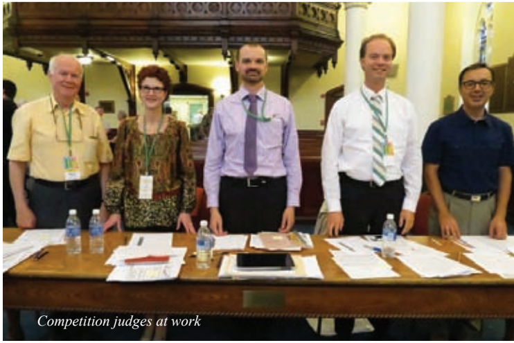
Competition judges at work