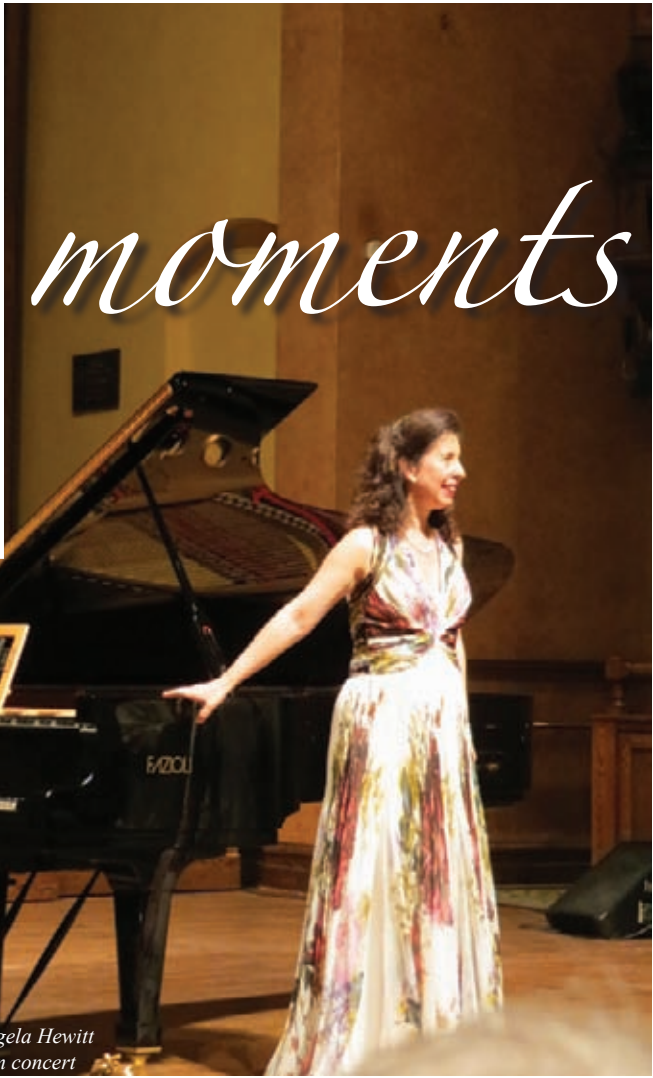
Angela Hewitt in concert