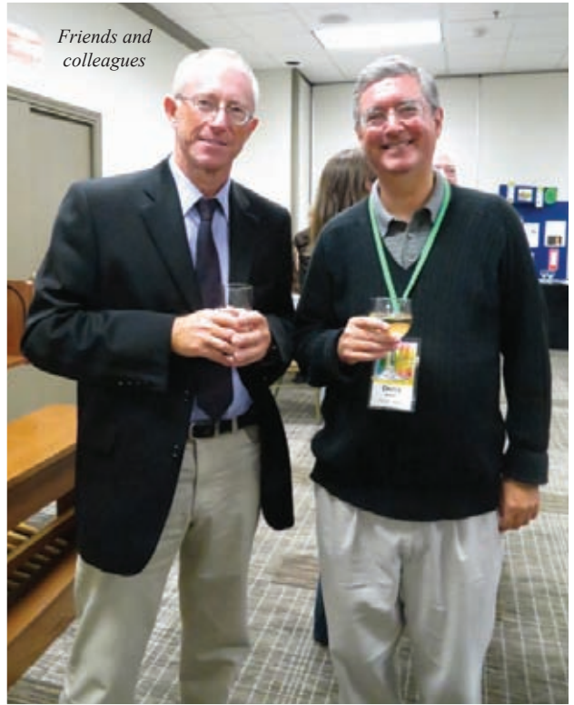
Friends and colleagues