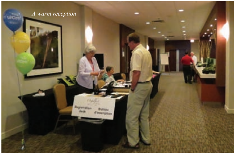
A warm reception