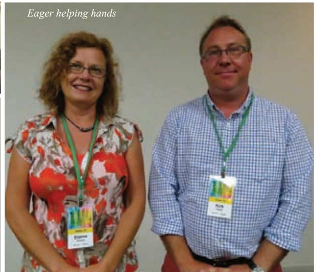
Eager helping hands